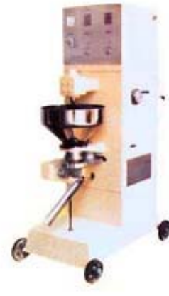
SY705 Fish, Meat Ball Forming Machine